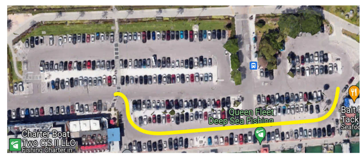
Making this area a one way to close the front parking spots but not lose all the parking spaces.

17. The Harbormaster will check the feasibility for making one area of the parking lot one way with angle parking to allow for closing of the front parking spots while opening up of more parking spots.