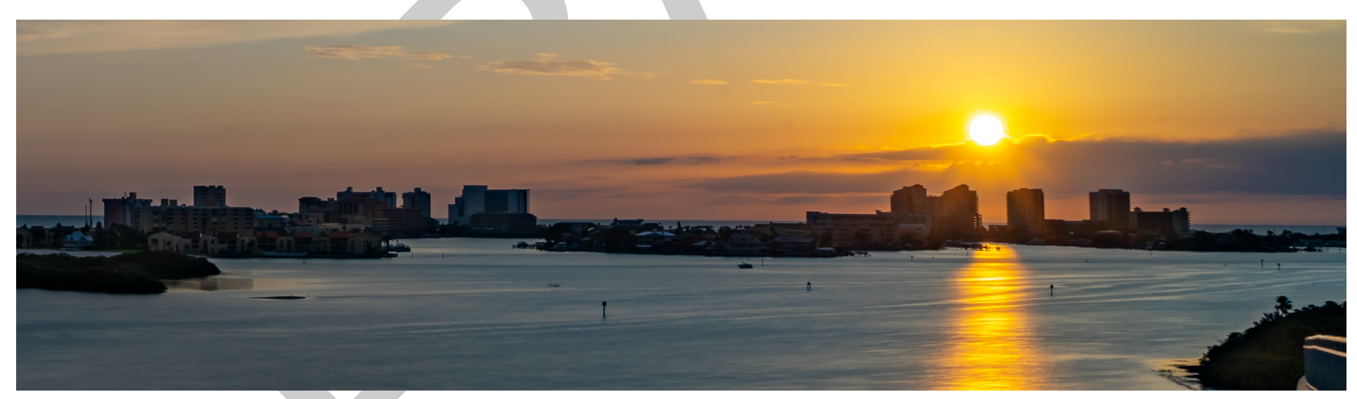
Sunset from Memorial Causeway bike trail.

Encourage properties that need city services to annex into the city prior to development to ensure consistency with city codes.